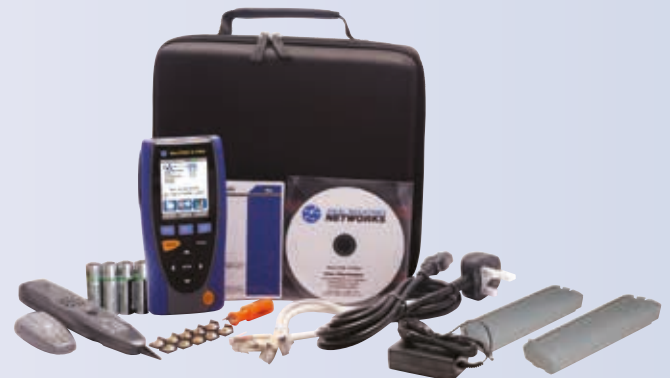
NaviTEK II PRO