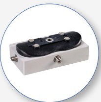
SA 105 Calibration Adapter to SV107