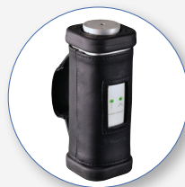
SV 110 Hand-Arm Vibration Calibrator