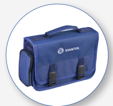
SA 47M Carrying Bag Fabric Material