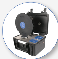
SV 111 Hand-Arm and Whole-Body Vibration Calibrator