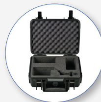
SA 76 Waterproof Carrying Case