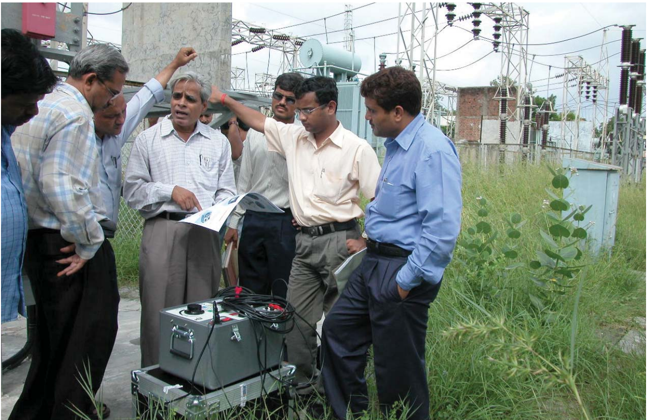
EZCT-10 in India