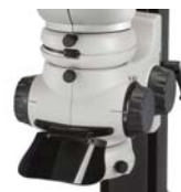
Step magnification multiplier