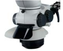
Oblique and direct viewer