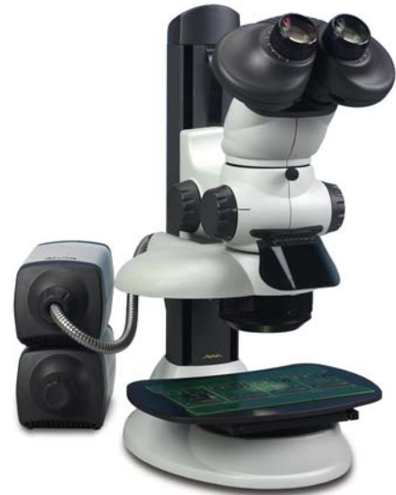
Alpha bench stand with optional oblique and direct viewer.