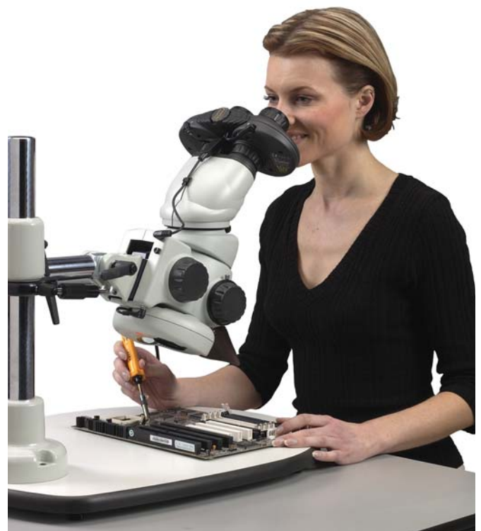
Alpha boom mount with optional fixed angle viewer.