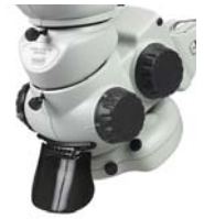
Fixed angle viewer