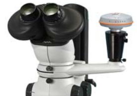
Image capture and archive