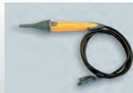
PR400 Optional remote probe