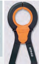
HT96U clamp for AC leakage current