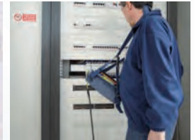
SP-0400 Hands-free kit